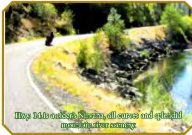
Hwy. 14 is a rider's Nirvana, all curves and splendid mountain river scenery.

HWY 14 FROM HARPSTER TO ELK CITY and back is worthy of Top Ten placement. When traveling north from Harpster angle left at the divisions of Hwy 13 & Hwy 14. About a half a dozen miles in you'll come to a stop sign at a "T" intersection, bear left and remember that junction-more on that later. What a delightful ride up the south fork! It is all turns, as Hwy 14 follows in a gradual climb the South Fork of the Clearwater River to Elk City. It's like a 55-mile long side-winder! Hwy 14 makes a superb leisurely cruise or it can be run with the heat turned up and the lean angles intensified. Most curves are of constant radius so get your entrance speed right and just rail through, just stay alert for crit-ters and falling rocks as most of the turns are blind.