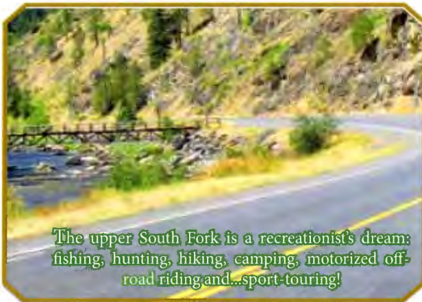
The upper South Fork is a recreationist's dream: fishing, hunting, hiking, camping, motorized off-road riding and...sport-touring!

HWY 14 FROM HARPSTER TO ELK CITY and back is worthy of Top Ten placement. When traveling north from Harpster angle left at the divisions of Hwy 13 & Hwy 14. About a half a dozen miles in you'll come to a stop sign at a "T" intersection, bear left and remember that junction-more on that later. What a delightful ride up the south fork! It is all turns, as Hwy 14 follows in a gradual climb the South Fork of the Clearwater River to Elk City. It's like a 55-mile long side-winder! Hwy 14 makes a superb leisurely cruise or it can be run with the heat turned up and the lean angles intensified. Most curves are of constant radius so get your entrance speed right and just rail through, just stay alert for crit-ters and falling rocks as most of the turns are blind.