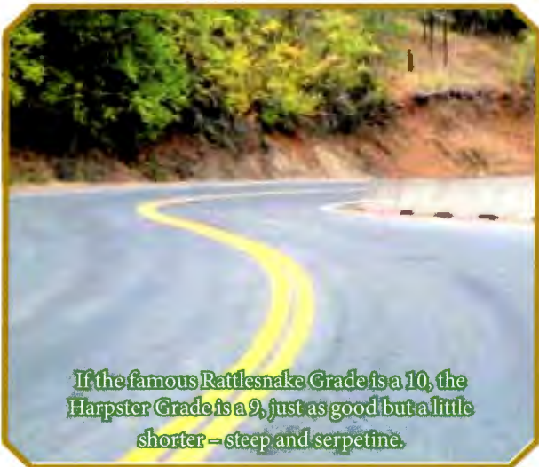
If the famous Rattlesnake Grade is a 10, the Harpster Grade is a 9, just as good but a little shorter – steep and serpentine.

Twenty-six miles of motorcycle road angles south then west. Corners are continuous and tight. Hwy. 13 is only 25, miles but takes 45 minutes to navigate. The section from Kooskia to Harpster flanks the South Fork and flatly meanders with it in union as the valley tapers. Past Harpster the roadway begins a fierce climb from 1,575 feet to 3,339 feet in elevation at Grangeville. This is Harpster grade it rivals any in the U.S for twisted, dramatic scenic riding pleasure.