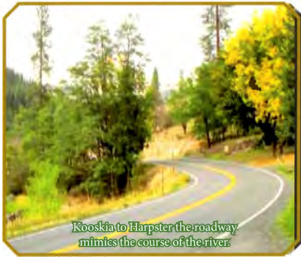
Kooskia to Harpster the roadway mimics the course of the river.