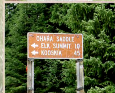
Nuggit Trail Near Newsome

OHARA SADDLE ← ELK SUMMIT 10 → KOOSKIA 45