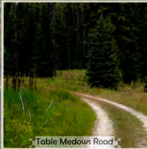
Table Meadows Road