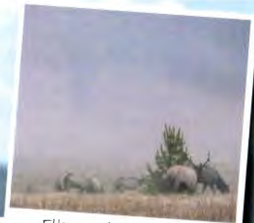
Elk grazing at dawn

Elk City and the surrounding area is well known for its beautiful seasons. Trout fishing and world-class big game hunting are popular activities. ATV enthusiasts frequently make this area their destination. Old lookout towers and ridge top road provide scenic vistas. Sunrises and sunsets are spectacular. During the warmer months wildflowers can be found growing in the meadows before the colors of fall explode from the foliage of the area.