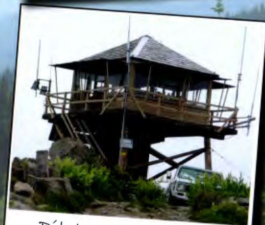
Pilot Knob Lookout

Elk City and the surrounding area is well known for its beautiful seasons. Trout fishing and world-class big game hunting are popular activities. ATV enthusiasts frequently make this area their destination. Old lookout towers and ridge top road provide scenic vistas. Sunrises and sunsets are spectacular. During the warmer months wildflowers can be found growing in the meadows before the colors of fall explode from the foliage of the area.